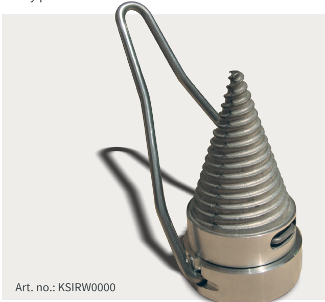
Art. no.: KSIRW0000

With the Rattlewedge, the arborist controls large pieces of wood without any effort. To see is to believe! The Rattlewedge, made out of light weight aluminium, hardly weighs 1,4 kg and can be taken into the tree easily. Undoubtedly, the Rattlewedge will be a standard device in any professional arborists toolbox!